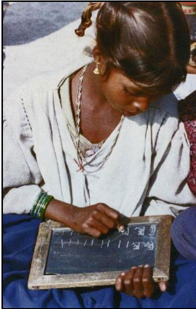
PV student in the early 1990s

contest and the display of science and art projects; they also take part in the annual school parade, organise Teachers' Day celebrations and the Graduation Event for the Year 10 students. These opportunities develop many positive qualities and skills for the students.