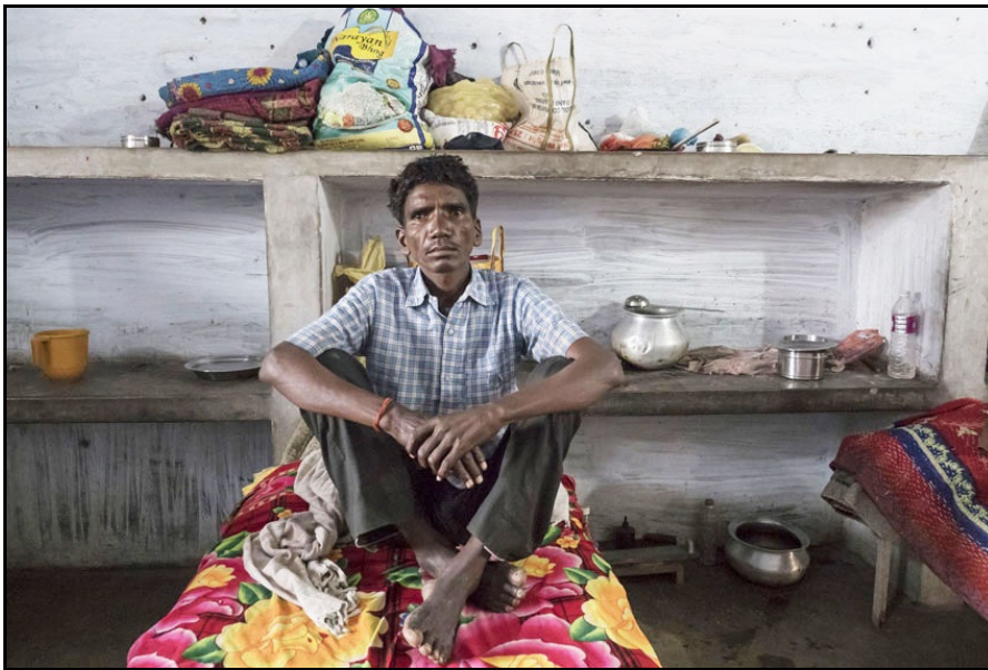
Patient in the Tuberculosis/AIDs clinic with his possessions behind