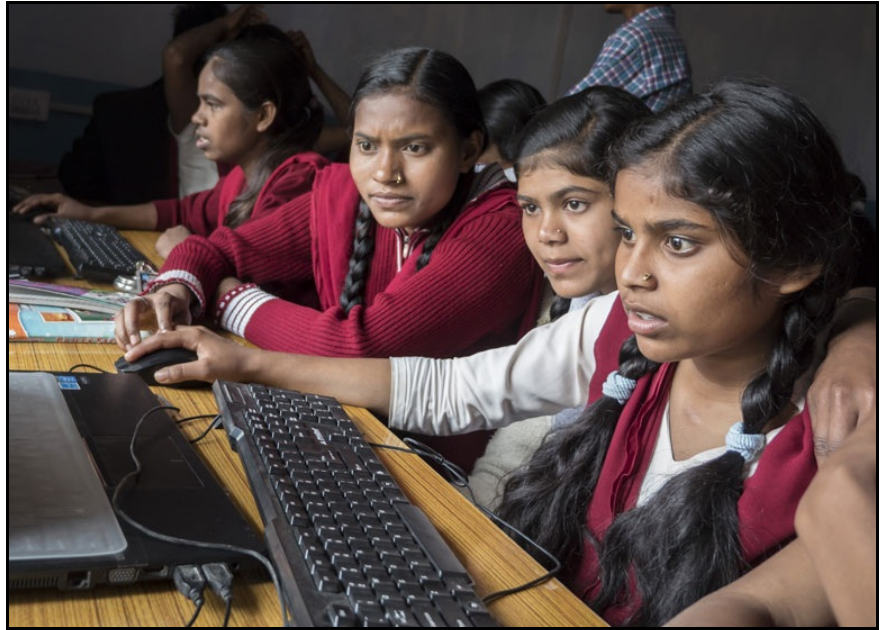
PV students in early 2015

A more detailed description of the events can be found on the school website ( www.pvschool.in ) in the current (2015) school newsletter.