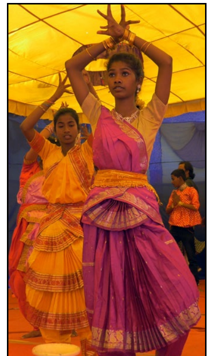
PV Students in school dance costumes

During nearly two months of staying in Bodhgaya, I was privileged to be part of many activities and witness the remarkable progress of the various building and construction stages of the new classrooms . There's a video tour of the completed construction on the PVS website . Your kind donations have most certainly contributed to the improvement of the school's teaching and learning facilities and therefore to the empowerment and transformation of the students through education; as Nandita Sakya (currently in Class 9) so aptly put in a