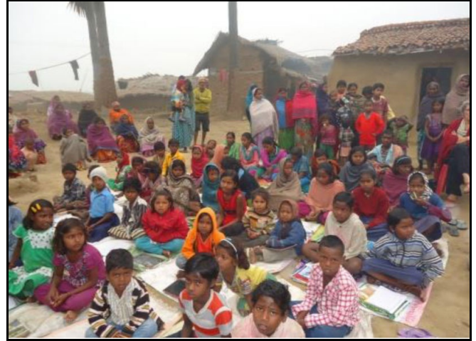
Outdoor classroom in children's program

There is a separate initiative which involves three non-formal education centres, each with a capacity for 30 to 40 children. Teachers are trained outside the formal schooling system to provide basic education in these centres. Children receive a uniform, a sitting carpet, textbooks and writing materials. These programs are at an early stage but the children are already engaged and there are many positive signs in terms of attitude and behaviour.