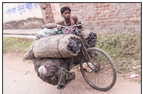
Coal transport in the Gomia area