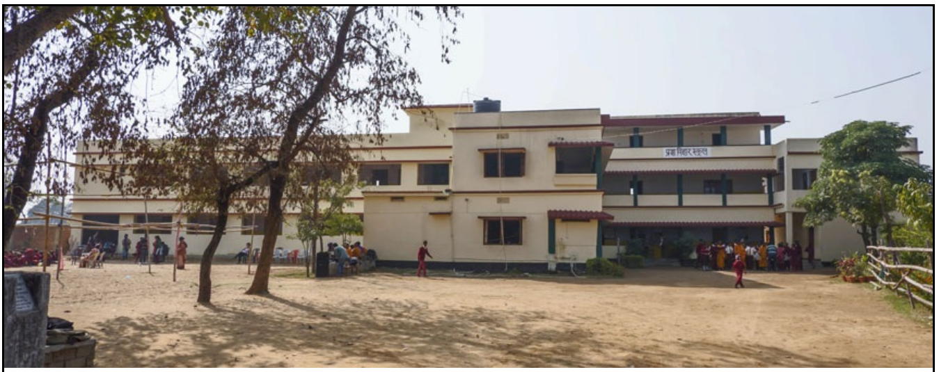
The school building in early 2015, with the new extension on the left

Students also showcase their skills in other areas: there is the annual inter-school speech, essay and drawing competition, the PV School based Ragoli