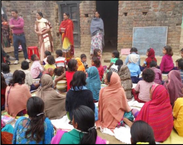
Women's health education

Many of the women and children in these villages are illiterate. One program we have provided funds for has a health and hygiene focus and it is run in small groups. It covers immunisation, personal hygiene, pregnancy care, environmental sanitation and basic information on illness: symptoms, prevention and cure.