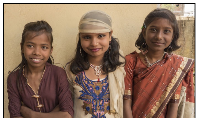
Students in school costumes for the 25 th anniversary dance presentation