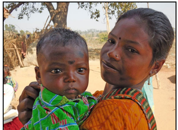
Santhal woman and child in ASK education program