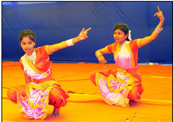
PV Students' dance presentation at the school's 25 th anniversary celebrations

You are most welcome to visit BDA programs in India. There is visitor accommodation at the sister's apartment in the Prajna Vihar School and a room for visitors at the Asha Seva Kendra program in Gomia. If you would like to visit the programs and stay at one of these places, please contact us.