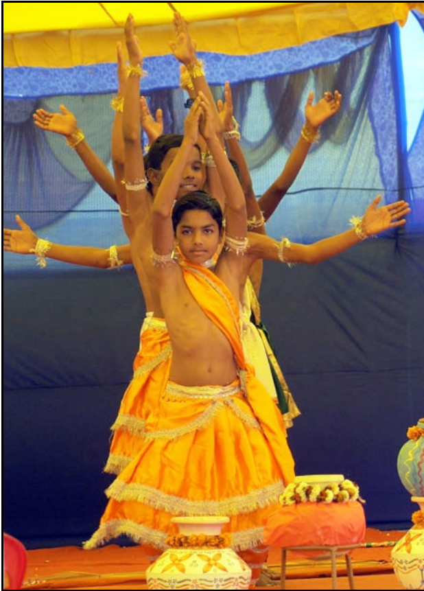
PV students performing at the school's 25 th anniversary celebrations

There have been many changes and new developments in BDA programs in the last year. In addition to our main focus, the Prajna Vihar School in Bodhgaya, the BDA has branched out, supporting new programs.