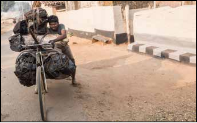
A man pushes a bicycle weighted down with coal.

Being illiterate, the Santhals are subject to unscrupulous types. They can be exploited for their land and the women can be trafficked--promised good jobs and end up in brothels.