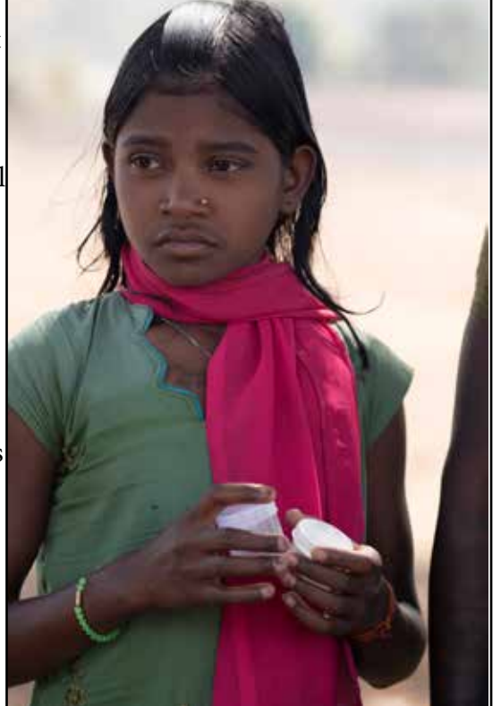
Receiving containers for a TB test. One of the containers is for her mother.

during the afternoon the girl realized that she was symptomatic of <sup>containers</sup>. TB, so she, along with her mother, were given containers to put sputum into.