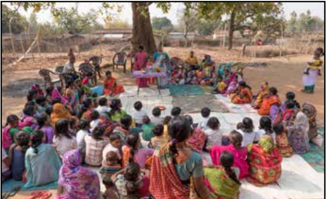
Women discuss small loans