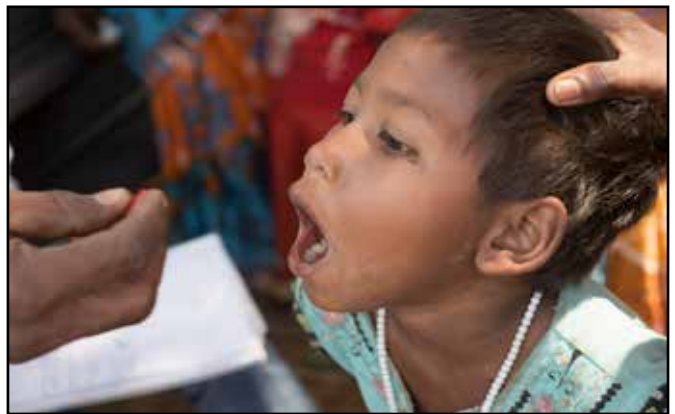
Vitamin A supplement.