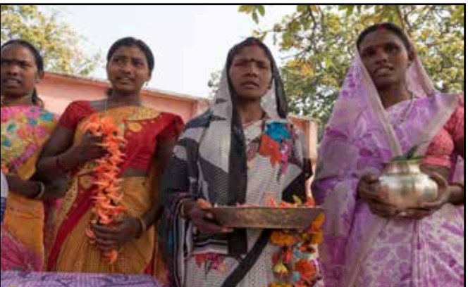
Village women meet a foreign guest.