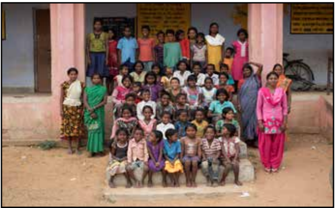
This was the largest single class I saw.

I attended a meeting in a village. The women had been notified that a guest would come so they had put on their best saris, collected flowers, and made garlands. As I sat in a plastic chair, the women walked out of a classroom of a government school into the courtyard where the