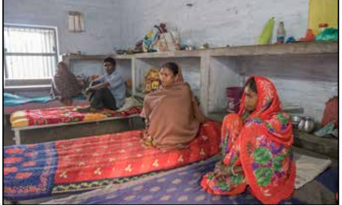
Patients in one of the two dorm rooms.